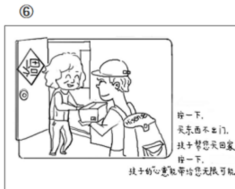
Just by tapping, instead of going shopping, your child can shop online for you.