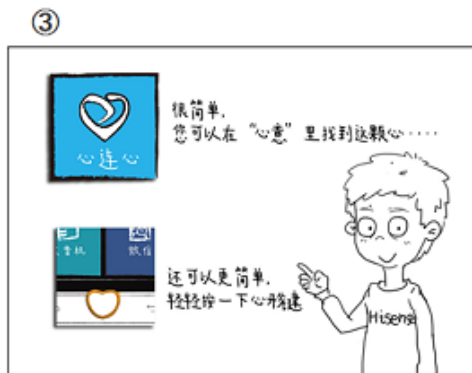
It's simple! Just find this heart-shaped button On your “心意” smartphone and tap it.