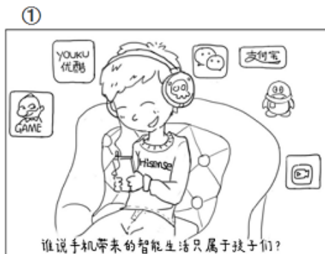
Do you think smartphones are only for kids?