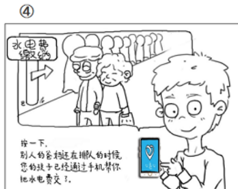
Just by tapping, while other parents are still waiting in line, your child has already paid the public service charge!