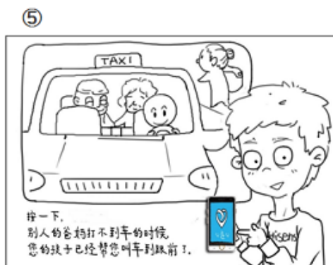
Just by tapping, while other seniors are waiting for a taxi, your child has already ordered you a taxi - and it's headed your location!