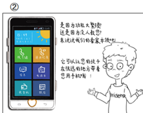
Are the features too troublesome? Or, is nobody around to help you use one? With the Hisense E360M, you can learn to use your smartphone even when your child is far away!